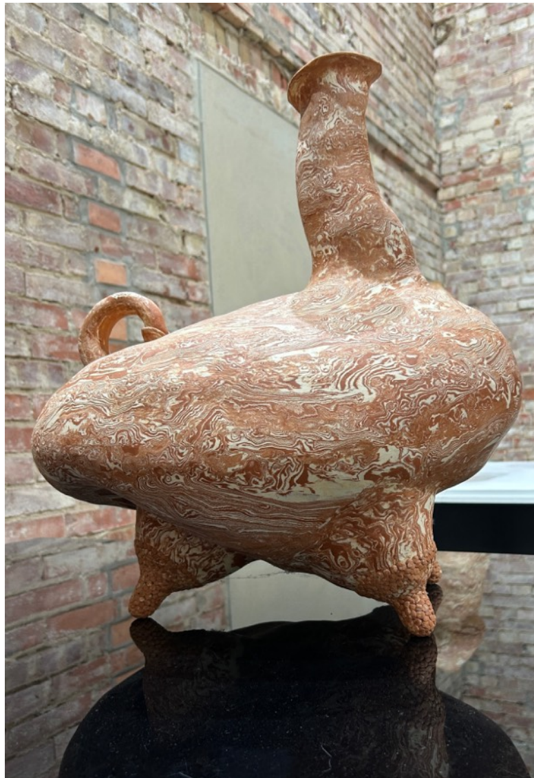
Ping Qui - Ceramics - 'Inseparable'